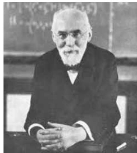
Figure 1: Jules Henri Poincaré (1854-1912)

Chaos theory was pioneered around the turn of the last century by the French physicist, philosopher and mathematician Jules Henri Poincaré (1854-1912) of the University of Paris (Figure 1). It began as an adventitious byproduct of his research on the classical three-body (also known as the n-body) problem in particle dynamics.